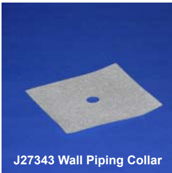
J27343 Wall Piping Collar