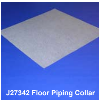
J27342 Floor Piping Collar